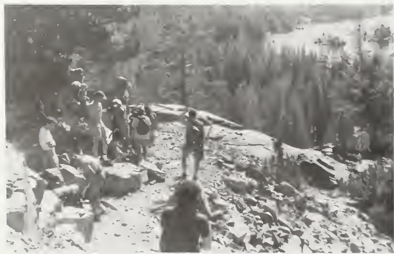
Figure 1 —Desolation Wilderness rangers are instructed to check all visitors for the required permit.

The Desolation Wilderness is administered by the Lake Tahoe Basin Management Unit and the Eldorado National Forest. They helped obtain a convenience sample of visitors without permits. Wilderness rangers are instructed to contact all visitors they encounter while performing their duties within the Desolation Wilderness. During this contact, the rangers check to see if the visitor obtained a permit before entering the area (fig. 1). Both day users and overnight campers must have a permit. The number of day-use permits is unlimited; however, the number of overnight permits for each entry point is limited during the summer season. Day-use permits are available from Forest